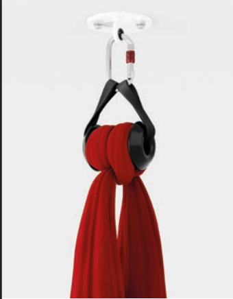
PLATE WITH SCREWS IN THE BEAM